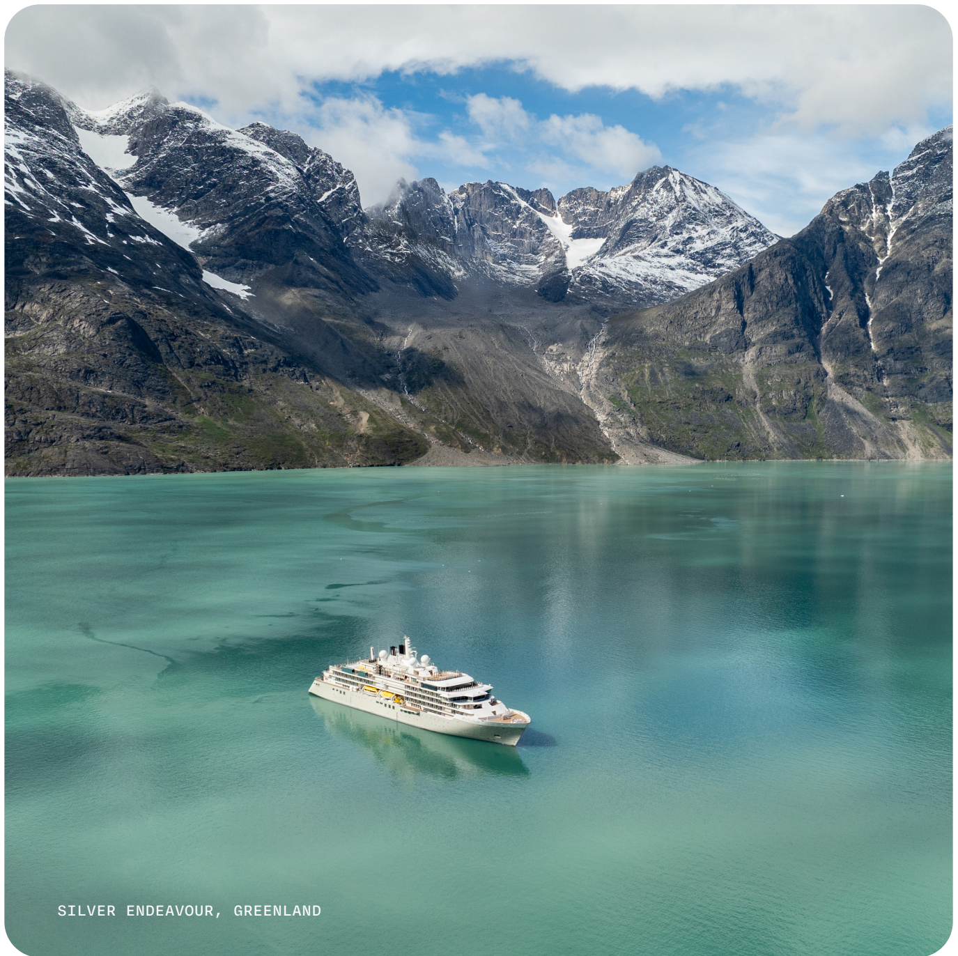
SILVER ENDEAVOUR, GREENLAND