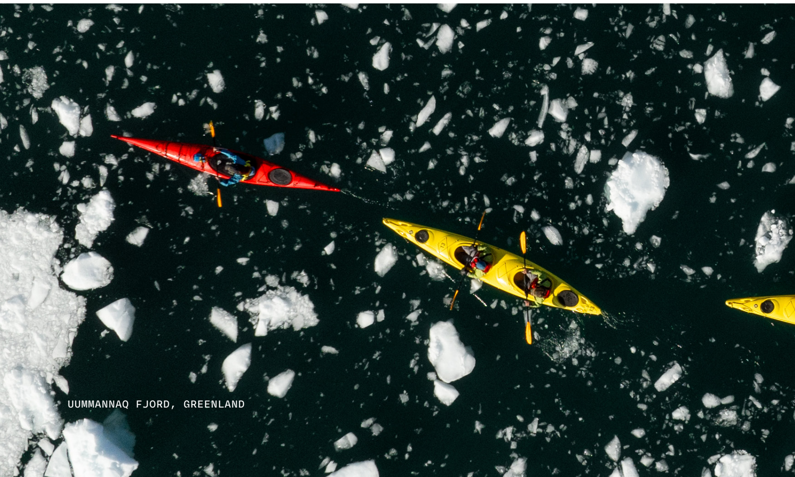
UUMMANAQ FJORD, GREENLAND