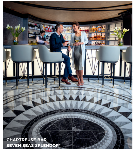
CHARTREUSE BAR SEVEN SEAS SPLENDOR®

Feel the freedom that can only be had when cruising the world with the Unrivalled Space at Sea ™ only found with Regent Seven Seas Cruises ®, where every luxury is included.