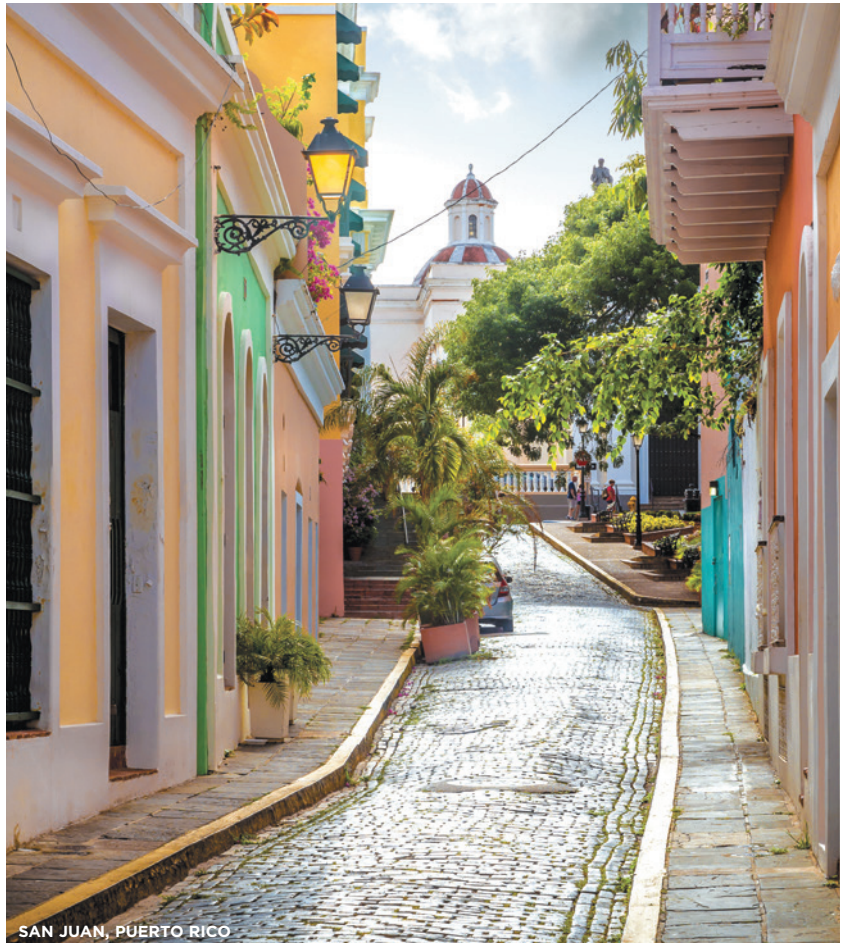
SAN JUAN, PUERTO RICO

View Included & Unlimited Shore Excursions at RSSC.com