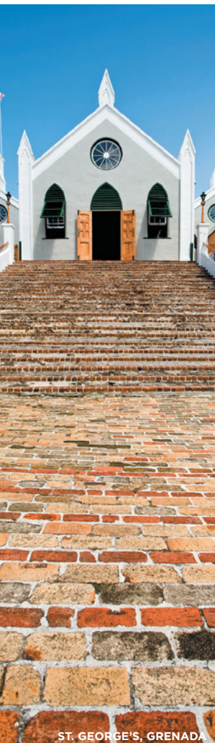
ST. GEORGE'S, GRENADA