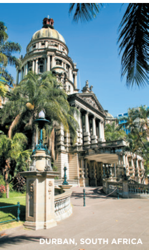
DURBAN, SOUTH AFRICA