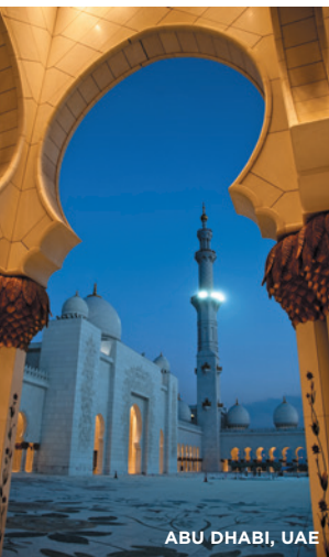
ABU DHABI, UAE