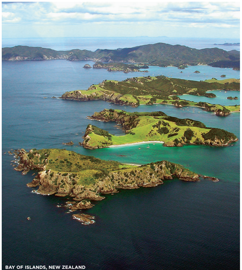
BAY OF ISLANDS, NEW ZEALAND

View Included & Unlimited Shore Excursions at RSSC.com