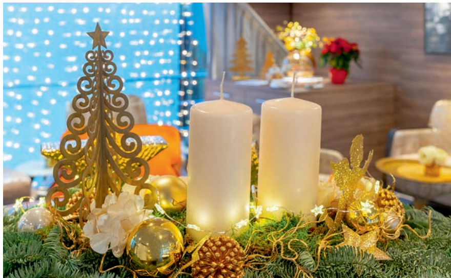
AMADEUS Imperial in the winter