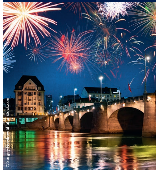
Basel's fantastic fireworks

After a multicourse Gala Dinner, we invite you on the Sun Deck to view the fireworks show.