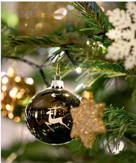
Festive glow on board your AMADEUS vessel