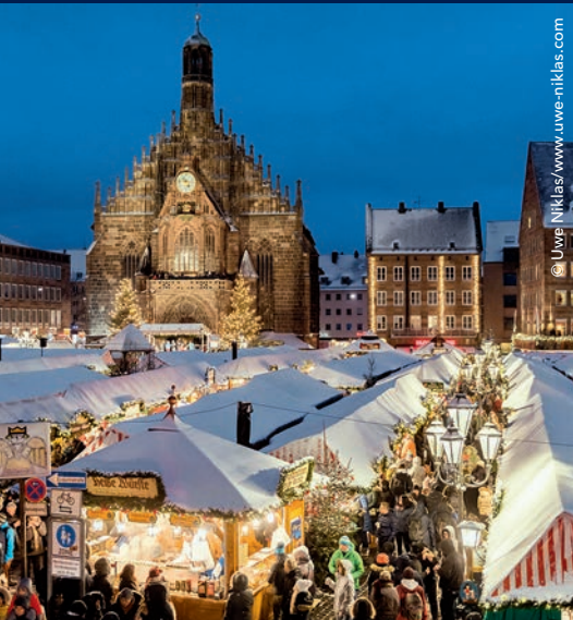
Nuremberg's Christmas market

Embrace the Christmas season in the fairytale setting of the Danube's legendary winter wonderland. Visit enchanting Christmas markets at Vienna's Schönbrunn Palace and Regensburg's Palais Thurn und Taxis. Sip mulled wine in the heart of the Wachau Valley's wine-growing region. Discover the allure of festive villages dotting the riverscape, and celebrate the day's end with a warm cup of glühwein.