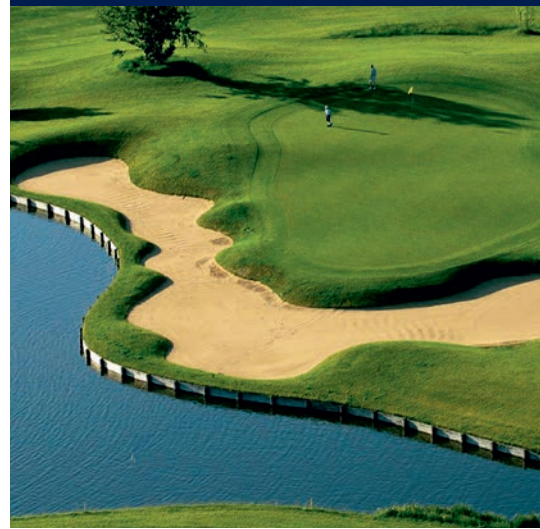
St. Leon-Rot Golf Club

This cruise departure is also offered as cruise-only option: Golf package (€ 1.350 per person) is optionally added to the regular cruise itinerary.