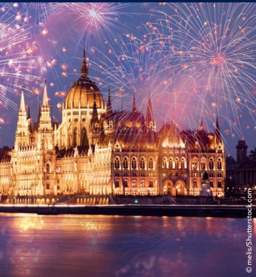
Cheers to the New Year!

Bid farewell to the old and welcome in the New Year in Budapest on board an AMADEUS river cruise ship. Enjoy the festivities with a 5-course Gala Dinner followed by a New Year's Eve celebration with traditional Danube waltzes and a spectacular firework's show. Dance the night away and greet new beginnings amidst the stunning panorama of Budapest's well-lit Parliament.