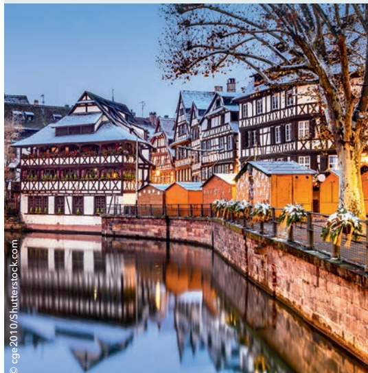
Strasbourg, Petite France

The Introductory Excursion Package offers a special selection of four pre-selected excursions that can be booked in advance with a price reduction of 15% compared to the unit price on board.