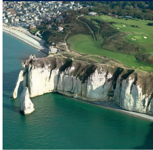
The 18-hole golf course Golf d'Étretat

This cruise departure is also offered as cruise-only option: Golf package (€ 1.590 per person) is optionally added to the regular cruise itinerary.