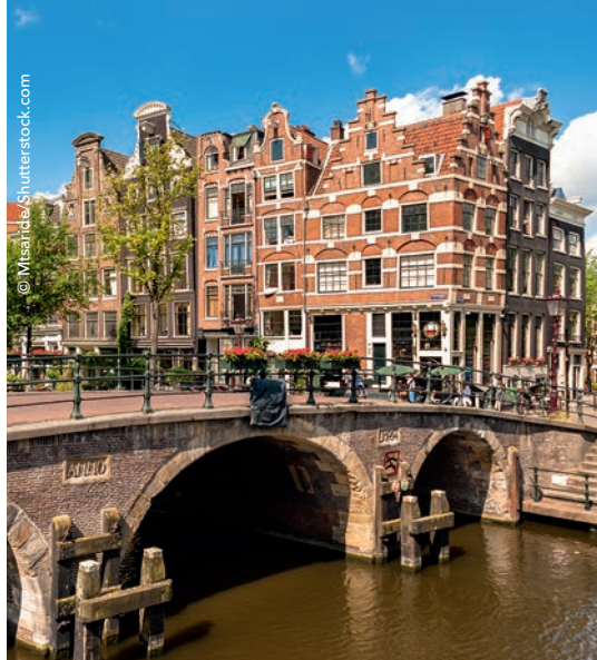
Discover Amsterdam on a canal cruise