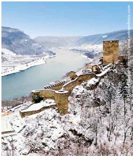
The Wachau Valley in winter time