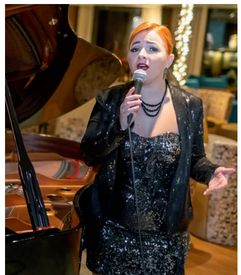
New Year's Party on board