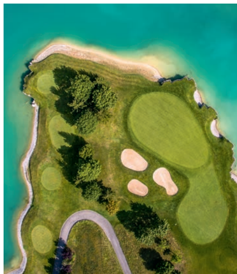
Fontana Golf Club