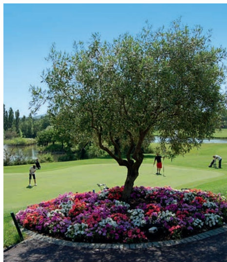
Golf de la Valdaine