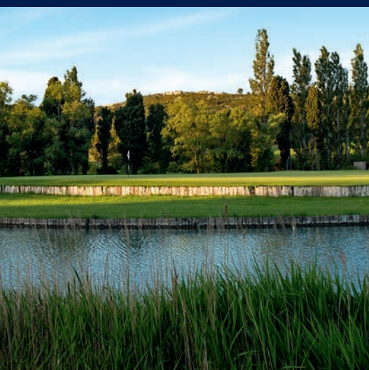
Golf de Servanes

This cruise departure is also offered as cruise-only option: Golf package (€ 1.350 per person) is optionally added to the regular cruise itinerary.