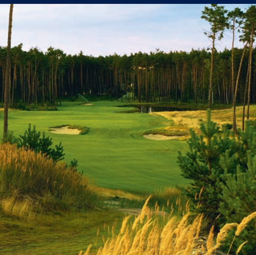
Penati Golf Club

This cruise departure is also offered as cruise-only option: Golf package (€ 1.350 per person) is optionally added to the regular cruise itinerary.