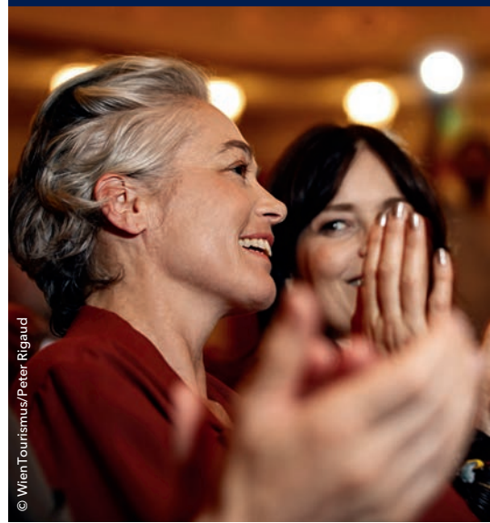
Enjoy classical music on land and on board