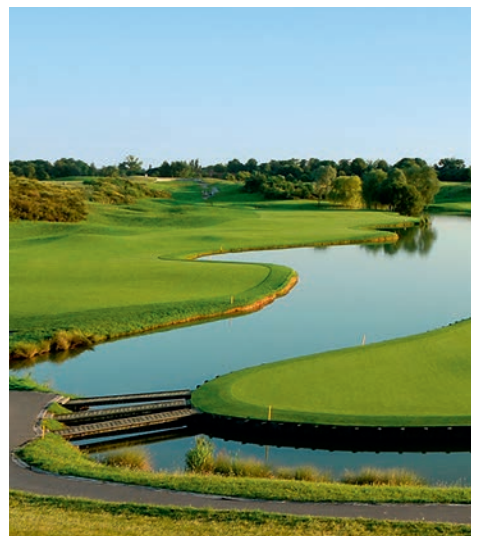
Le Golf National