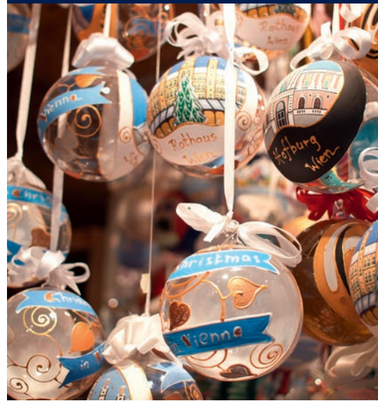
Christmas tree bauble in Vienna

Follow the scent of freshly baked gingerbread and food cooking over a wood fire to the magical Christmas markets on the Danube. Combine a historic tour of Vienna, Passau, Regensburg, and Nuremberg with a stroll through decorated stalls bursting with special Christmas gifts, unique art and hand-crafted holiday ornaments. Channel your inner Christmas spirit in cities radiating in light, laughter and the joy of the season.