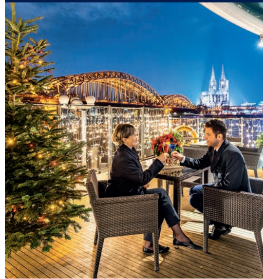
Your ship is docked near the Cologne city center

Explore dreamy towns and landscapes lining the shores of the Rhine. During this magical time of the year, glittering cities radiate along the water's edge with fairy lights adorning its buildings and streets. The smells and sights of the Christmas markets deliver the joy of the season. Enjoy a festive cup of mulled wine and immerse yourself in century-old traditions while drinking in the holiday cheer.