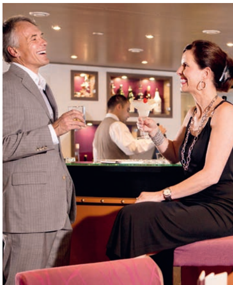
New Year's Eve Celebration