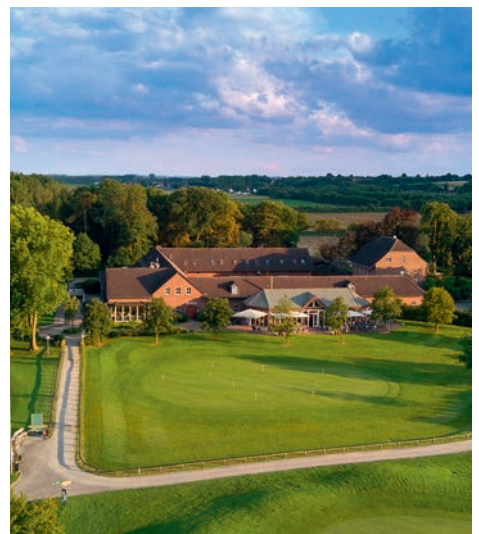
Golf & Country Club Velderhof