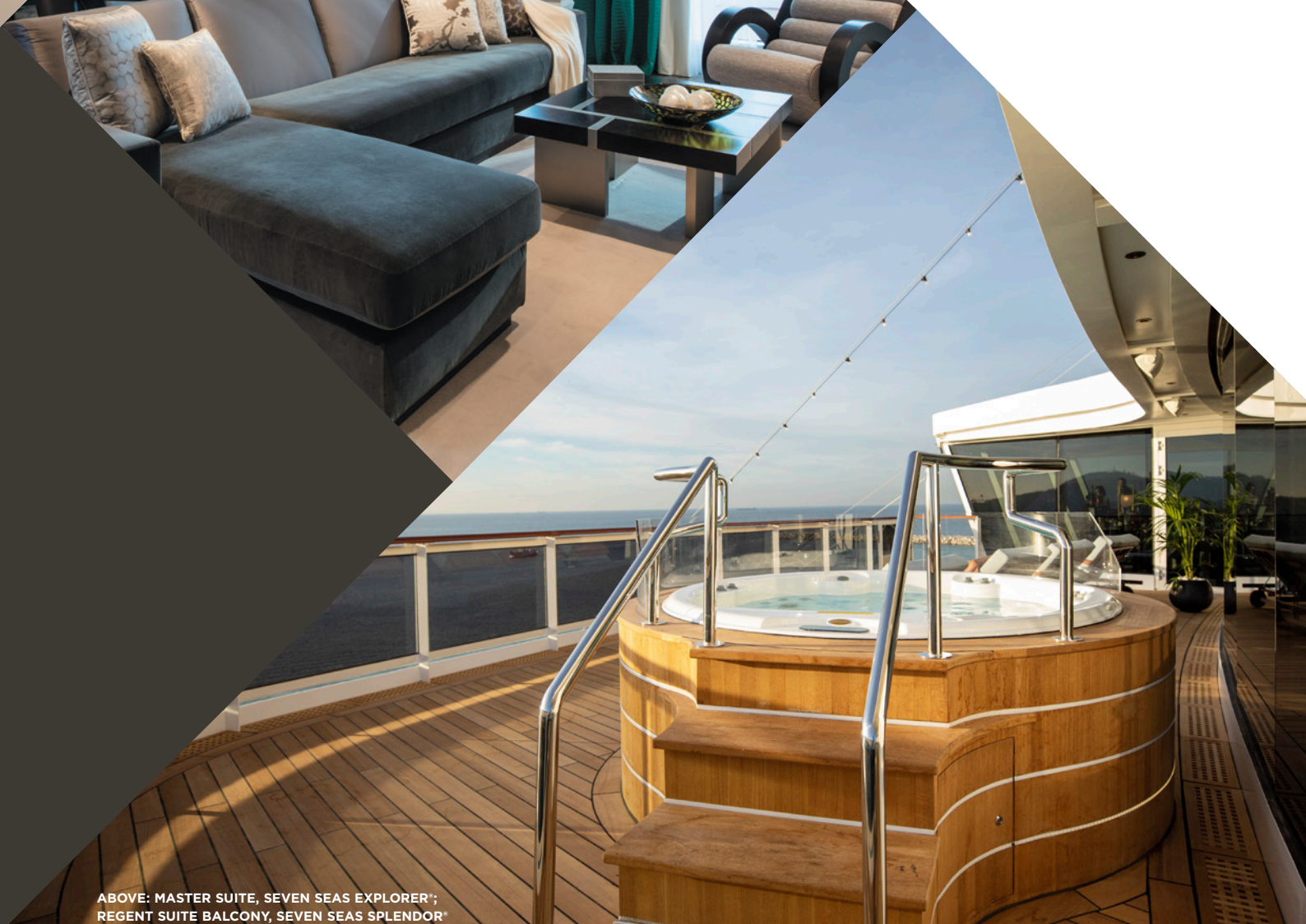
ABOVE: MASTER SUITE, SEVEN SEAS EXPLORER®; REGENT SUITE BALCONY, SEVEN SEAS SPLENDOR®