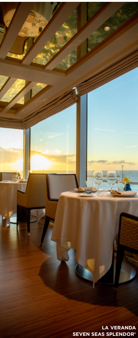
LA VERANDA SEVEN SEAS SPLENDOR®