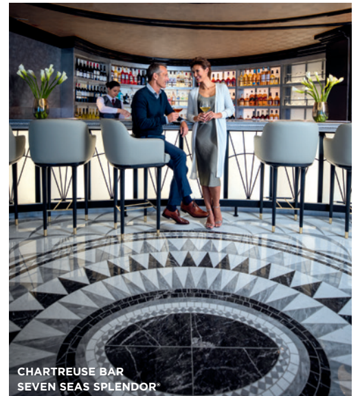
CHARTREUSE BAR SEVEN SEAS SPLENDOR®

Feel the freedom that can only be had when cruising the world with the Unrivalled Space at Sea ™ only found with Regent Seven Seas Cruises ®, where every luxury is included.