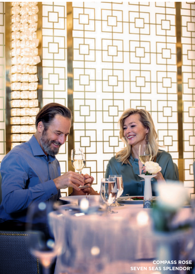
COMPASS ROSE SEVEN SEAS SPLENDOR®