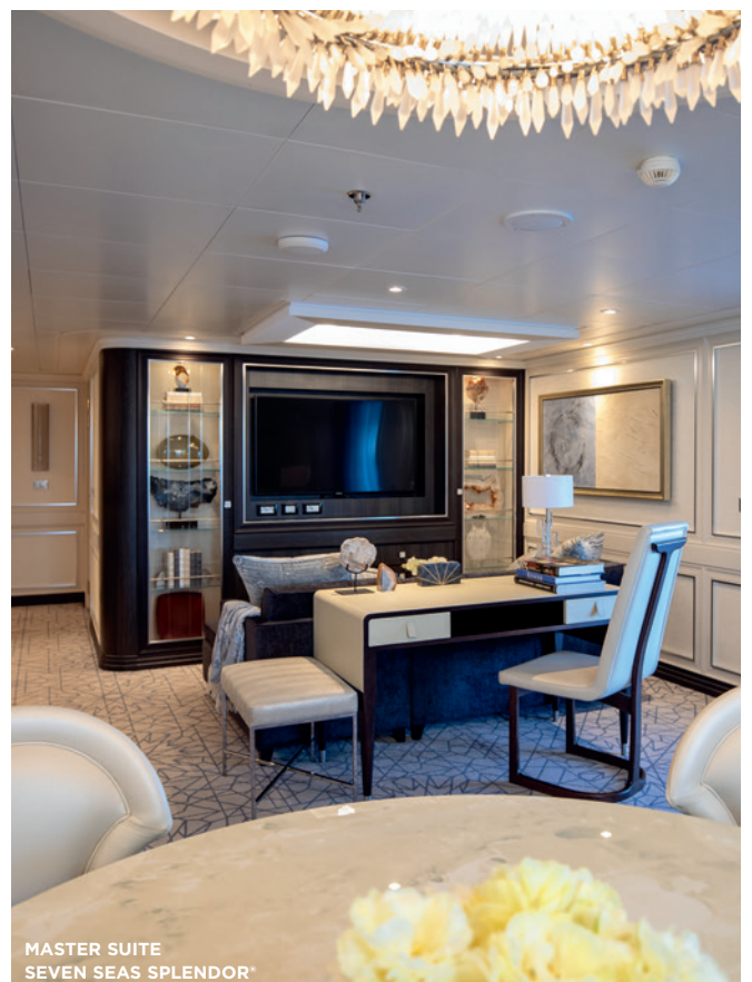
MASTER SUITE SEVEN SEAS SPLENDOR®