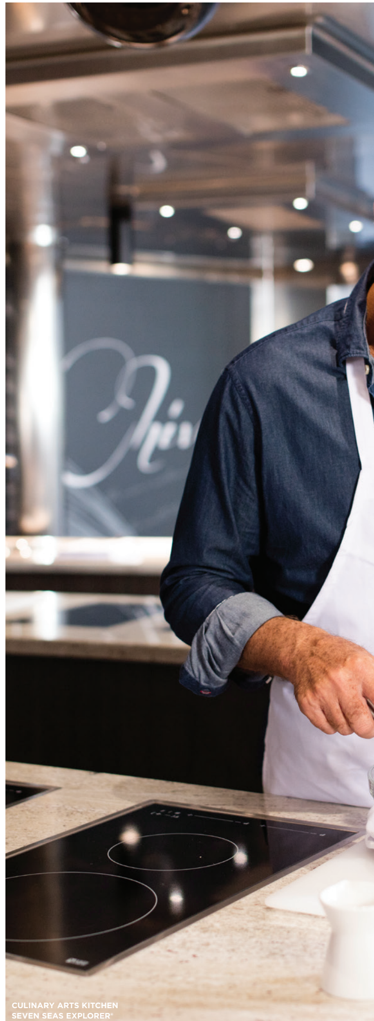
CULINARY ARTS KITCHEN SEVEN SEAS EXPLORER®

From the top-of-the-line speciality restaurants aboard each ship to the shore excursions delivering an abundance of unforgettable memories at incredible destinations, all the inclusions and personalised service create a journey that will feel designed just for you, from beginning to end.