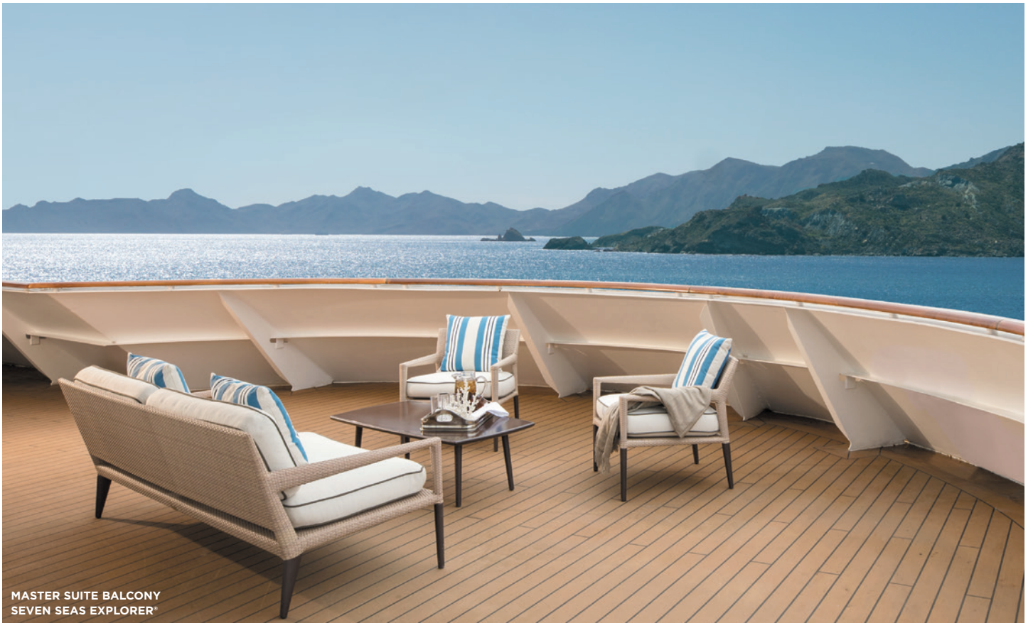
MASTER SUITE BALCONY SEVEN SEAS EXPLORER®