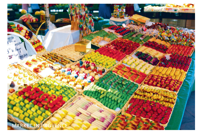
Sample Optional shore excursions~